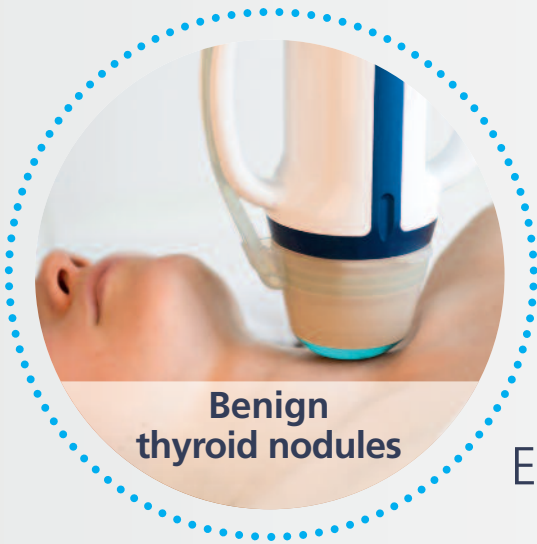
Benign thyroid nodules